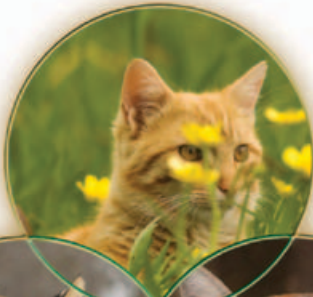
Pet and stray cats

Only cats and other members of the cat family shed Toxoplasma in their feces. Cats may shed the parasite in their feces for 7-21 days the first time they get infected with Toxoplasma . If they are allowed outside, pet cats can get infected when they catch and eat wild animals. Toxoplasma can be found in the feces of cats below: