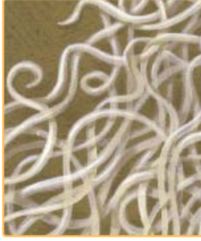
Adult and advanced stage roundworms, illustrated at magnification

Roundworms enter the body when ingested as eggs that soon hatch into larvae. These larvae travel through the liver, lungs, and other organs. In most cases, these “wandering worms” cause no symptoms or apparent damage. However, in some cases they produce a condition known as visceral larva migrans . The larvae may cause damage to tissue and sometimes affect the nerves or even lodge in the eye. In some cases, they may cause permanent nerve or eye damage, even blindness.