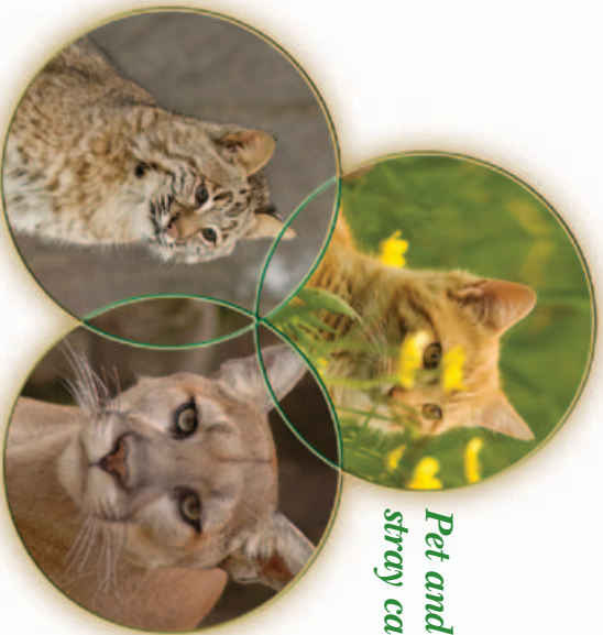
Pet and stray cats

Only cats and other members of the cat family shed Toxoplasma in their feces. Cats may shed the parasite in their feces for 7-21 days the first time they get infected with Toxoplasma . If they are allowed outside, pet cats can get infected when they catch and eat wild animals. Toxoplasma can be found in the feces of cats below: